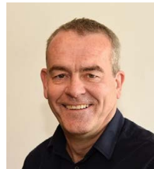
NICK DAVIES (Flog It)

www.fieldingsauctioneers.co.uk • 01384 444140