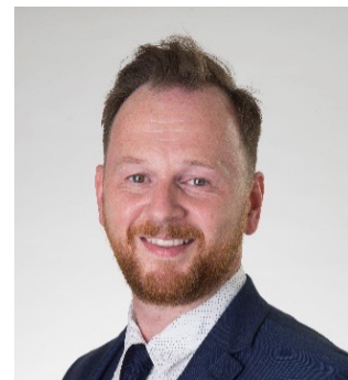
WILL FARMER (Antiques Roadshow)

SO WHY NOT COME DOWN TO ONE OF THEIR AUCTIONS OR ATTEND ONE OF THE REGULAR FREE VALUATION DAYS EVERY TUESDAY BETWEEN 10AM-4PM.